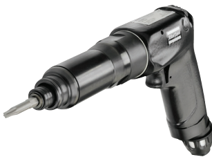
S2450-P / S2452-P

Both versions feature adjustable torque settings, trigger and push start for pistol grips, and lever and push start for straight models.