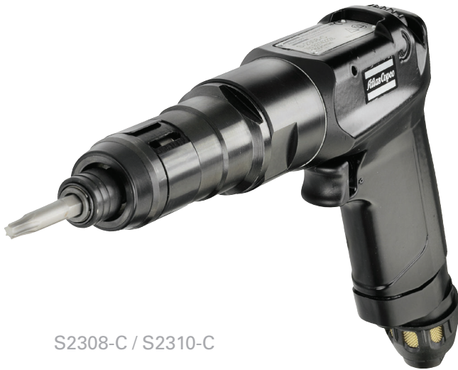
S2308-C / S2310-C