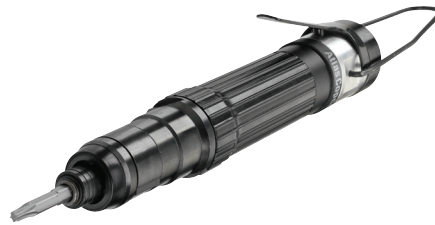
S2340-C / S2360-C / S2370-C