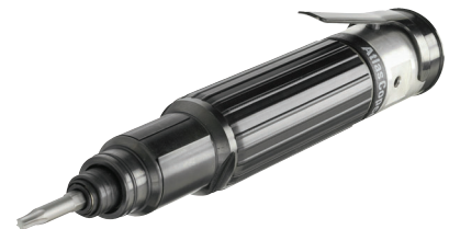
S2416-L / S2426-L / S2428-L